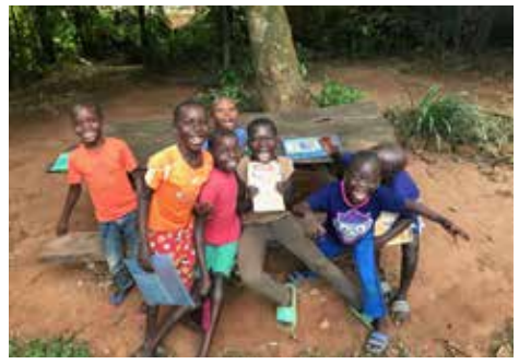
Uganda: Class CREW