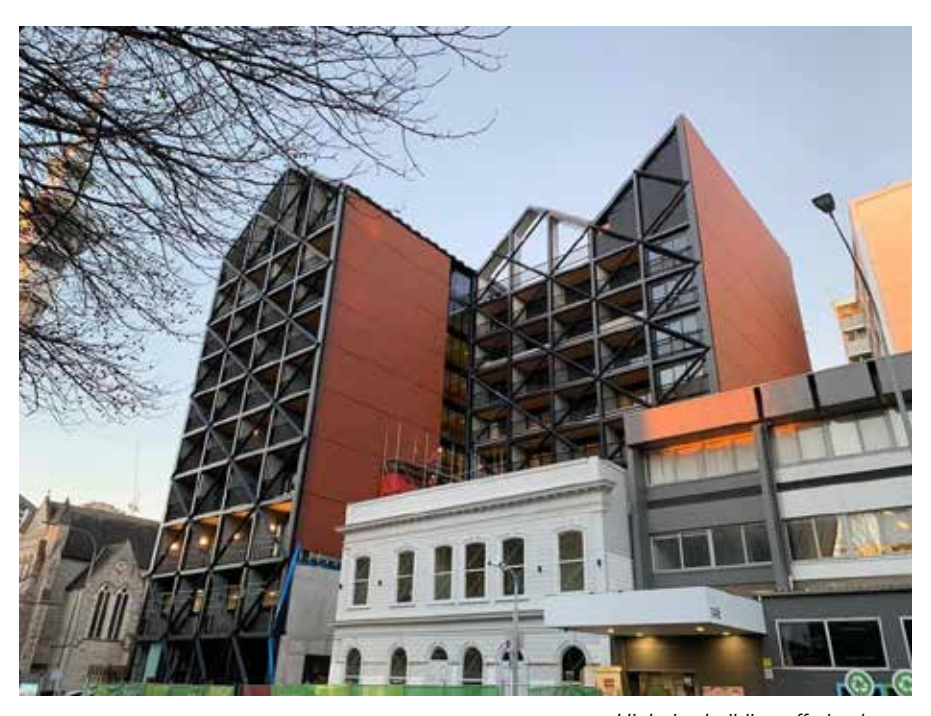
High rise building offering hope.