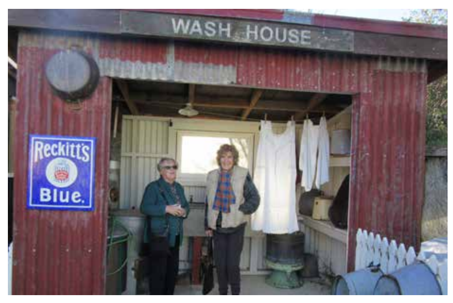
Willowbank Authentic washhouse