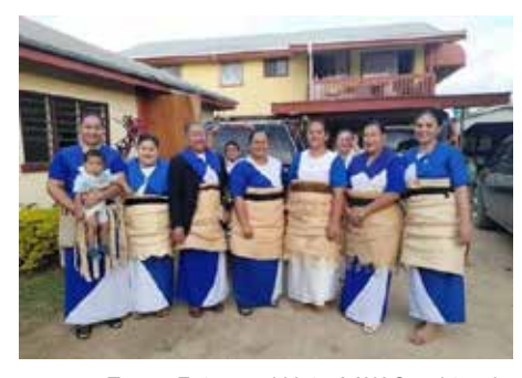
Tonga Episcopal Unit, AAW Combined Service at All Saints Anglican Church, Fasi