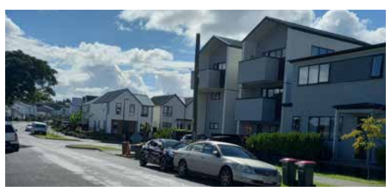
The Tamaki regeneration

The 30 year project has what is called the 'Tamaki guarantee': the promise to support people to stay in their own neighbourhood.