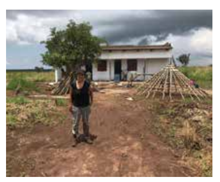
Uganda: newly constructed Pwunu Dyang ODH Health Center